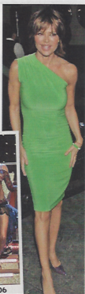
Avanti says the 5-foot-7 Rinna is 113 pounds.

Us . "It made me happy, because I wasn't killing myself for a perfection that doesn't exist."