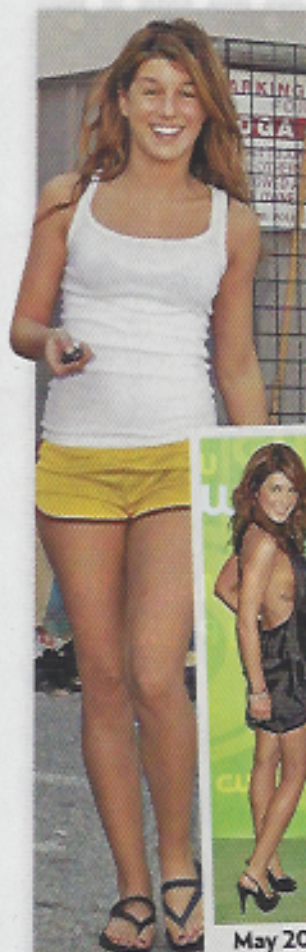
Grimes looked fuller in Los Angeles March 8.